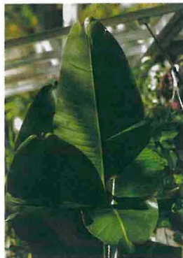
06 Bird of paradise plant