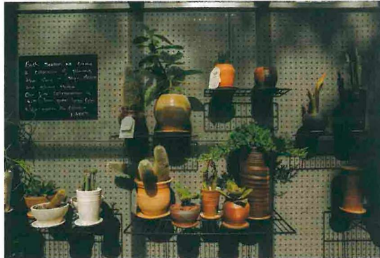
02 Plants on sale at a farmers' market