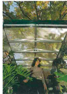
07 Tulita doubles as a greenhouse