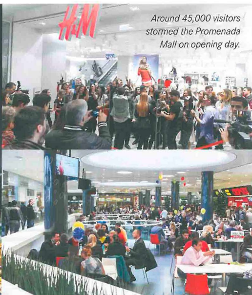
Around 45,000 visitors stormed the Promenada Mall on opening day.